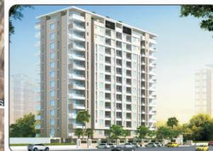
KIARA, Near Anukampa Tulip, Before NRI Chauraha, Jagatpura, Jaipur.